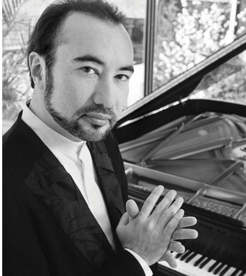
JAMES EHNES & JON KIMURA PARKER